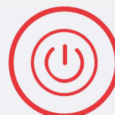
Starting system test