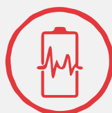
Battery health state test